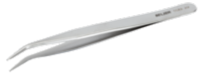
SMD Tweezers with Grooved Tips and 30° Bent Angle SM115-SA 120 mm 5589 AM