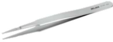
SMD Tweezers for Positioning and Soldering 1 mm Components 120 mm 5546 AM